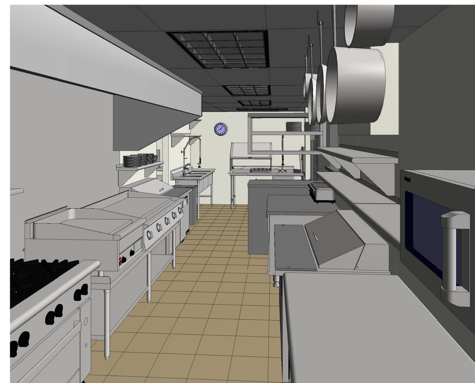
② 3D View 2