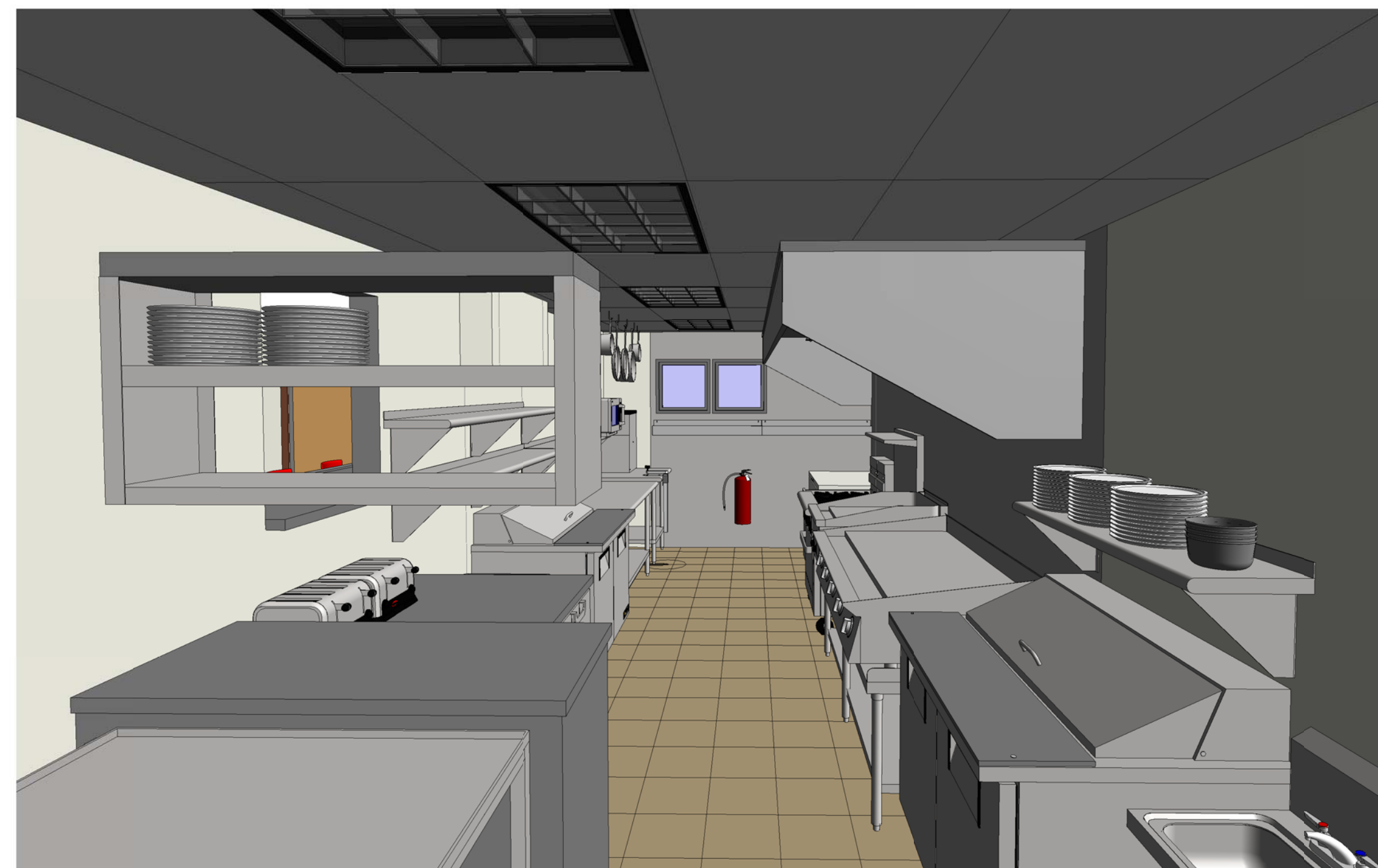
① 3D View 1

ALL SIZES AND METHOD OF CONSTRUCTION SHALL BE IMPLEMENTED AT THE DISCRETION OF THE FABRICATOR AS AVAILABLE TOOLS AND MATERIALS MAY RESTRICT CERTAIN ASPECTS OF THE PROJECT.